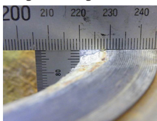
Severe Flange Corrosion