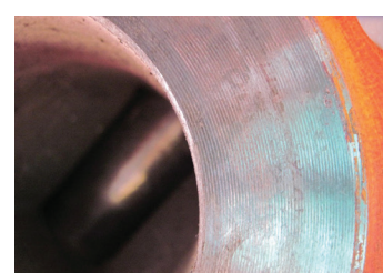
No Corrosion with ALKY-ONE®